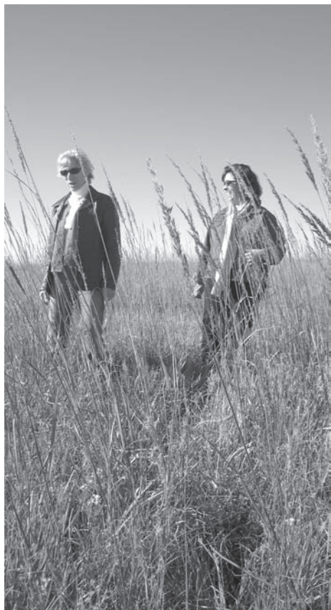
Tourists size up the Tallgrass Prairie

Located north of Kansas City, Atchison is a Norman Rockwell painting--one of Kansas' most charming cities. Here you can visit the childhood home of Amelia Earhart, which has become a museum, and can retrace the footsteps of Lewis and Clark, who celebrated the first Independence Day in the West there. The town's Visitor's Center, Rail Museum and the County Historical Museum are all housed in the former 1880 Sante Fe Freight Depot. There's a narrated trolley tour available--one that points out the towns beautiful Victorian homes and