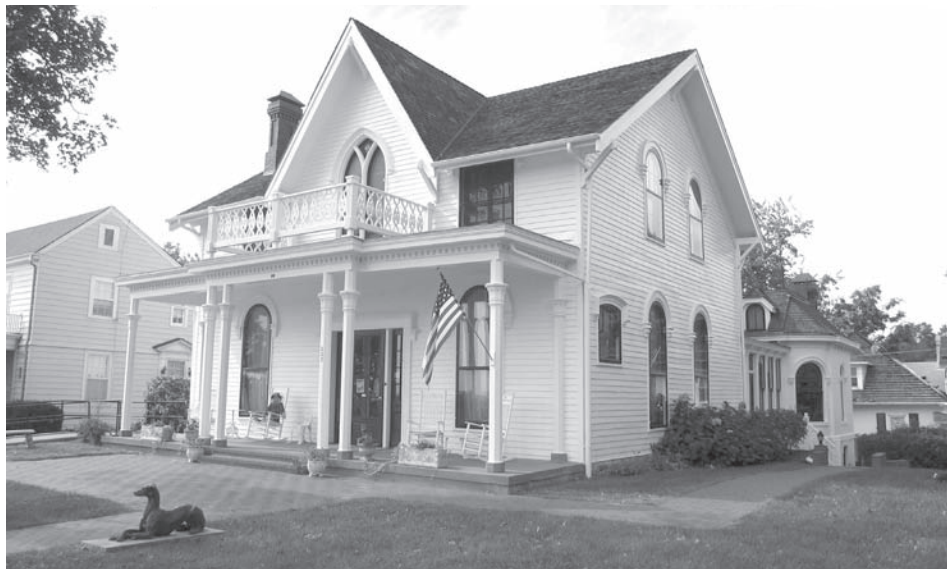
The childhood home of Amelia Earhart is in Achison, Ka.

If you're searching for what makes America great, it may be time to plan next year's vacation in the nation's heartland: Kansas. Flying into Kansas City, you can see real Americana, meet genuinely friendly people, and find out a lot you didn't know about history--and all no more than three hours drive from Kansas City airport. You'll also discover that at a time when folks are watching their money, a Midwest vacation is much less expensive than any place you can name on the East coast. Plus