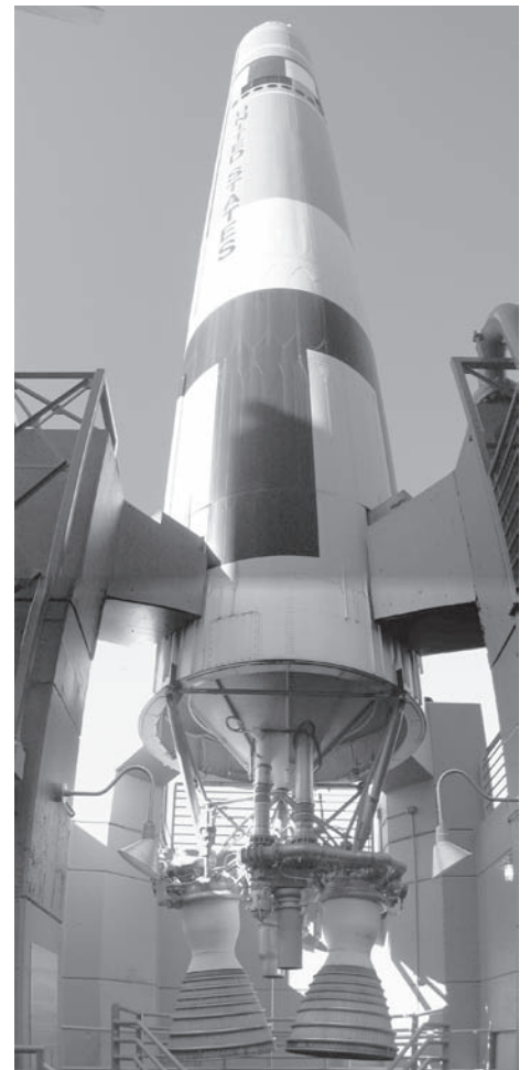
Rocketry at Hutchinson's Cosmosphere

prefer B&B's chose the right city. Among the best are the Woodward, the Brickyard Barn and McClintock Place.