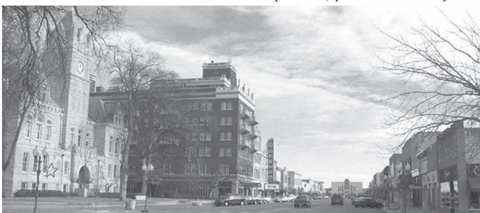
Downtown Manhattan, Kansas

Hutchinson is also the home of the 2006 U.S. Senior Open at Prairie Dunes Country Club, which is to be held July 3-9, 2006. (www.2006usso.com) (Those interested in volunteering for the event—and they'll need lots of volunteers—should go to http://tinyurl.com/a4m4m ). The town is