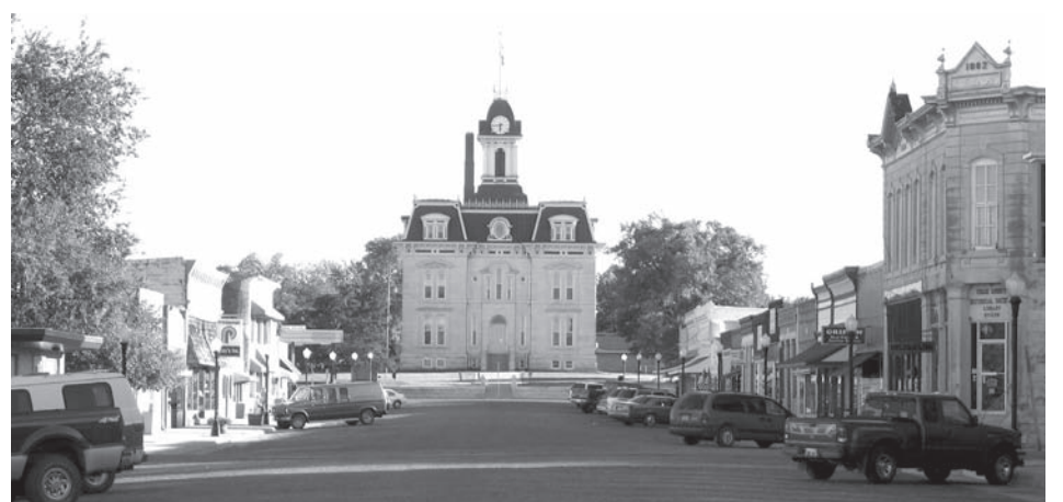
The Chase County Courthouse and the downtown of Cottonwood Falls

Independence is a special place for those who loved movies like "Picnic" or "Busstop," as these William Inge classics are based on this very special town. There's a William Inge Theater Festival April 26-29, 2006 to celebrate this legacy. The town also has a log cabin replica of the