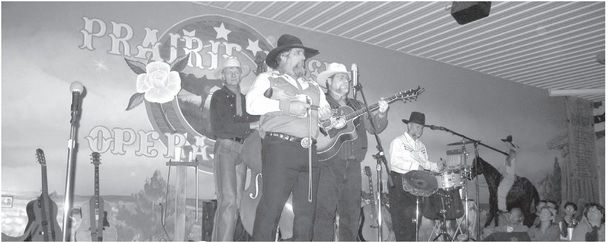
The Prairie Rose Wranglers perform at the Prairie Rose Chuckwagon Supper, attended by thousands monthly