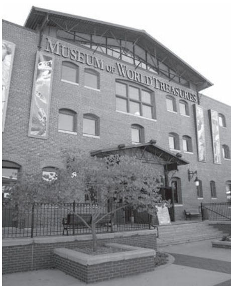
Museum of World Treasures in Wichita Little House on the Prairie. (www.indks-chamber.org)

Hutchinson offers the remarkable Kansas Cosmosphere and Space Center—the only Smithsonian-affiliated air and space museum, and home to the original Apollo 11 space capsule. The museum also features a SR-71 Blackbird spyplane, a life-size mockup of the Space Shuttle, and German V-1 and V-2 rockets. The Cosmo also boasts the largest collection of space artifacts outside the Smithsonian, and the largest collection of Soviet space hardware in the Western world. There's also a Planetarium and an Imax Theater. An Elderhostel Astronaut Training Program is offered for those aged 55 and over. (www.cosmo.org)