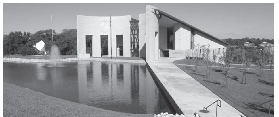
The Dole Institute of Politics

Cottonwood Falls is a traditional Midwestern small town with its stately Chase County Courthouse gazing down upon stores on Main Street. There are quaint shops, an inn that is the only 4-Diamond Inn in Kansas--the Grand Central Hotel. This 19th century hotel was bought at auction for $40 back taxes and completely gutted and restored--making it a real showcase, and just about the only place in the area to dine if you want a really great steak. Also there's the Emma Chase Café, which invites acoustical musicians far and wide to play for diners every Friday night. It's