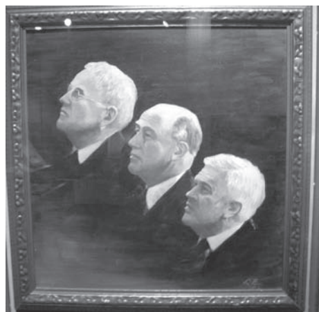
One of many of Dwight Eisenhower's oils at the Eisenhower Museum in Abilene, this one showing John Foster Dulles, George Humphrey and George Wilson

Abilene is the home of Dwight Eisenhower. The complex consists of five buildings located on 22 acres. They include the family home where the Eisenhowers lived from 1898 to 1946, museum, library, visitors center, and place of meditation (the burial site of President and Mrs. Eisenhower and their first-born son Doud Dwight). The Dwight D. Eisenhower Library & Museum is not to be missed, especially if you were unaware that he was quite the amateur artist. Many of his oils and drawings are at the museum. Plus there are many exhibits that make one mindful of the 50's. There's an interesting exhibit on Mamie Eisenhower's wardrobe that really shows how styles can change in 50 years. Also on the grounds is the Eisenhower home, a very modest one. But its Eisenhower's ambivalence to war that really stands out, a stunning irony. One finds oneself drinking in his memorable quotes, which are on